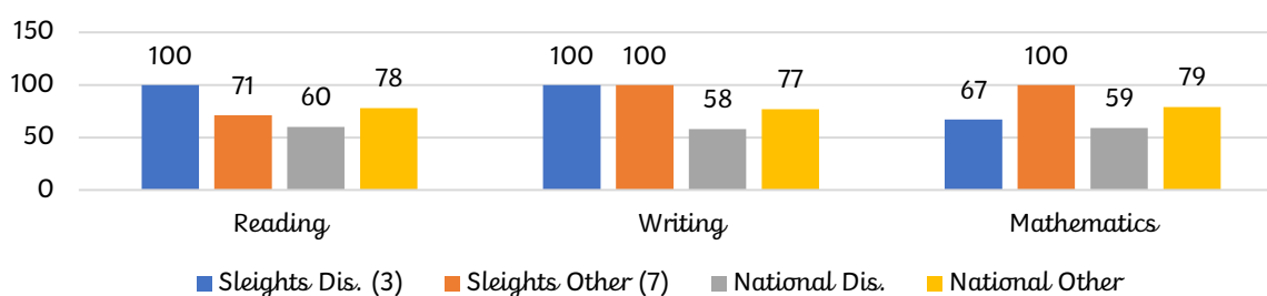
Attainment at KS2 (2023 SATS)