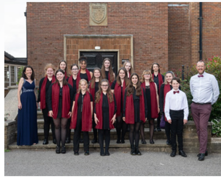
Congratulations to all those involved!