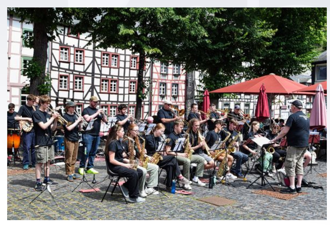
County Big Band performing in Monschau, Germany

"I am delighted to hear that this year's tour was another resounding success. It is not surprising that those who heard the musicians would like them to return. It shows the wonderful talent that we have in North Yorkshire."