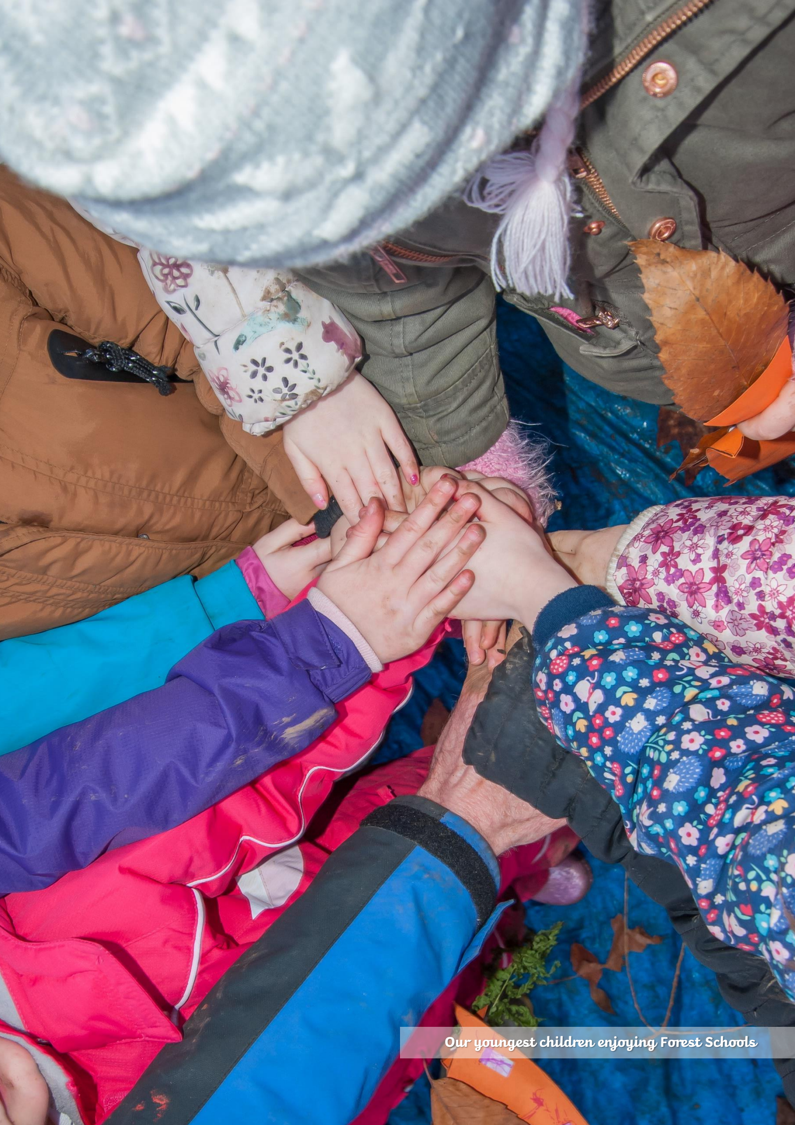
Our youngest children enjoying Forest Schools