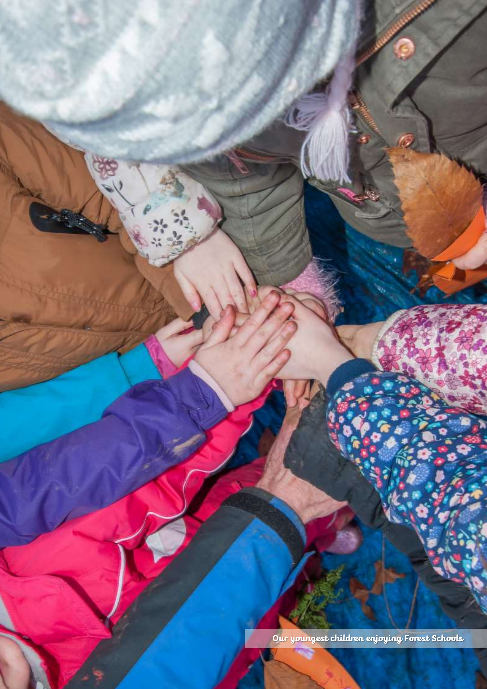
Our youngest children enjoying Forest Schools